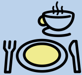
Lunch & Coffee For Free